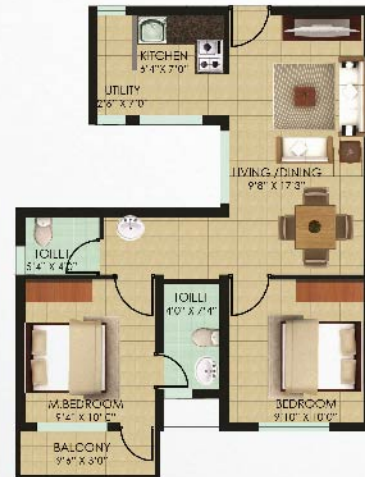
FLAT NO: G04-904 769 SQFT 2BHK + 2T