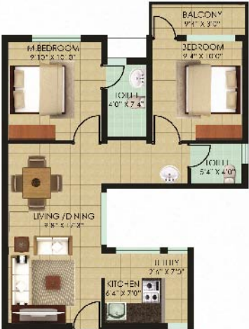
FLAT NO: G10 -910 762 SQFT 2BHK + 2 T