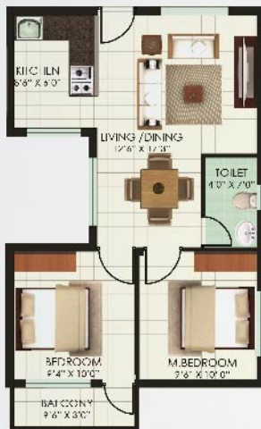
FLAT NO: G01-901 673 SQFT 2BHK + 1T