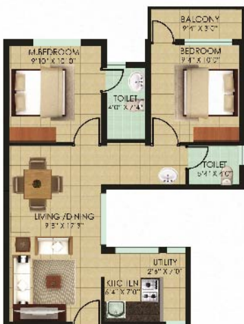
FLAT NO: G10-1310 762 SQFT 2BHK + 2T