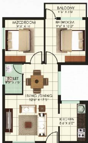
FLAT NO: G6/-1307 673 SQFT 2BHK + 1T