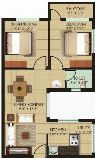
FLAT NO: G12 912 669 SQFT 2BHK + 1 T