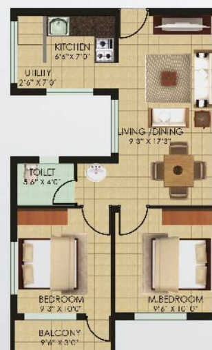
FLAT NO: G06-906 669 SQFT 2BHK + 1T