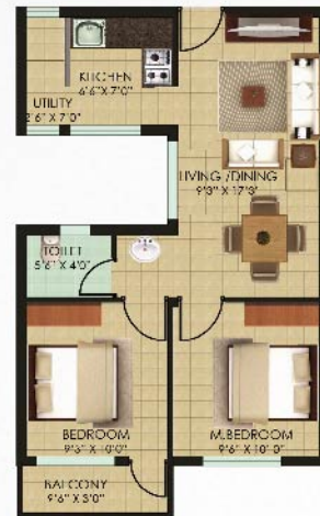
FLAT NO: G02-902 660 SQFT 2BHK + 1T