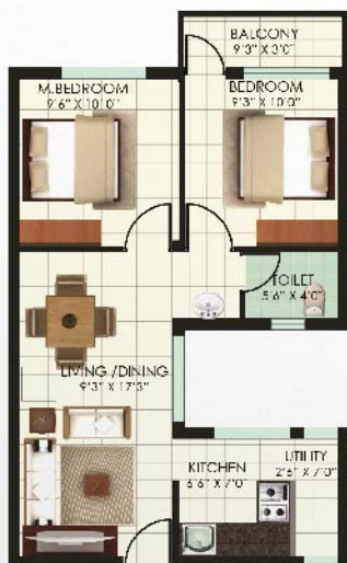
FLAT NO: G11-1311 669 SQFT 2BHK + 1T