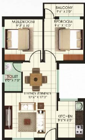
FLAT NO: G6/ 90/ 673 SQFT 2BHK + 1 T