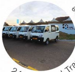
24/7 Internal Transport Service