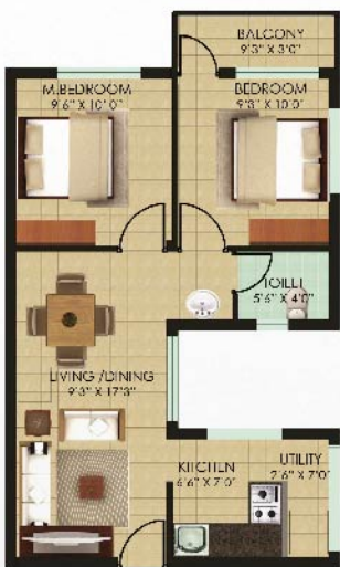
FLAT NO: G12-1312 669 SQFT 2BHK + 1T