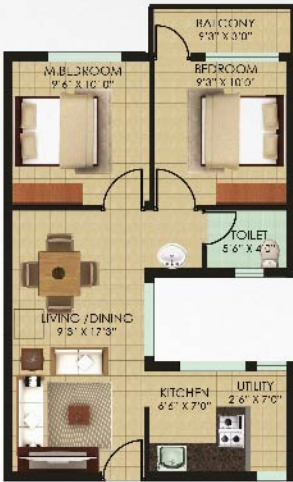
FLAT NO: G08 908 660 SQFT 2BHK + 1 T