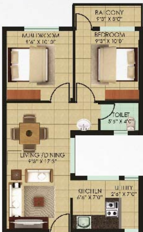
FLAT NO: G06-1308 660 SQFT 2BHK + 1T