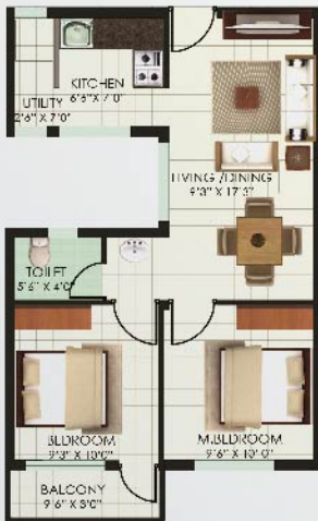
FLAT NO: G03-903 660 SQFT 2BHK + 1T