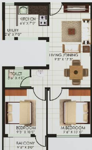
FLAT NO: G05-905 669 SQFT 2BHK + 1T