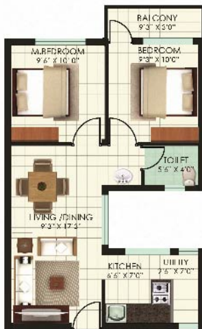
FLAT NO: C09 -909 660 SQFT 2BHK + 1 T