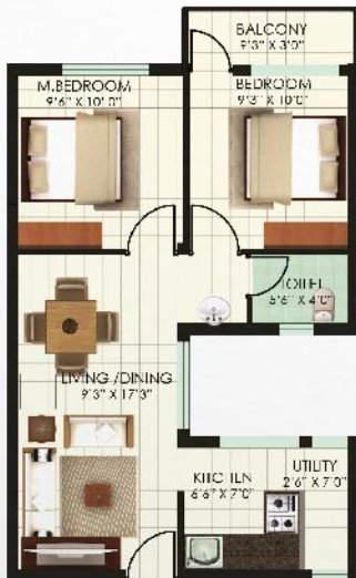
FLAT NO: G11-911 669 SQFT 2BHK + 1 T