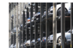
Multi-level Car Parking