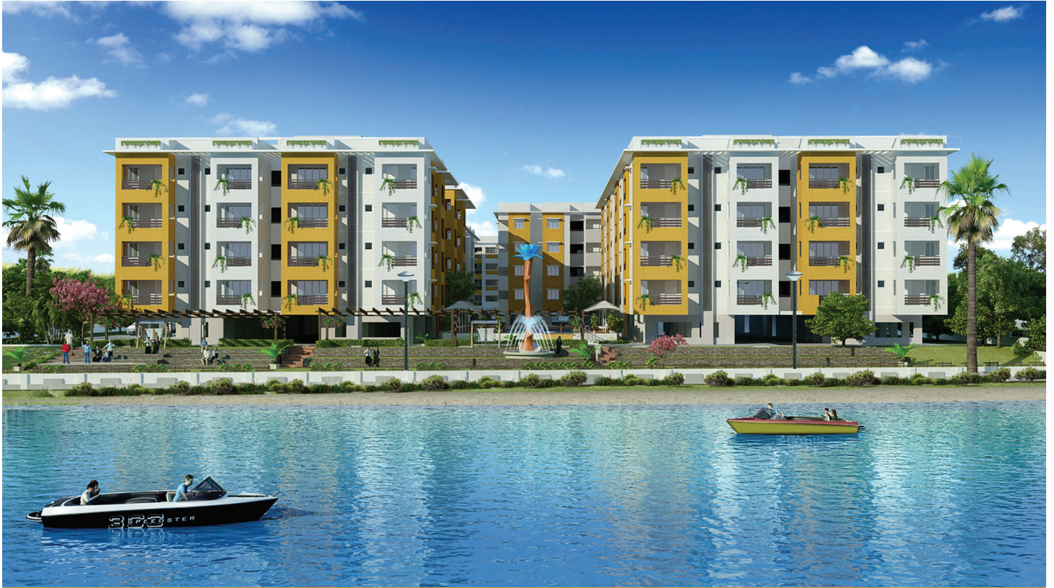
204 Units: 2 BHK, 3 BHK and Studio Apartments

A walk by the lake is sheer delight; even a little peek at it from the window can take away all the stress of the day. Living in a home close to a lake is nothing short of pure bliss. Come reside amidst greenery, serenity and harmony. Come reside at Pushkara.