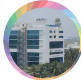
TCS - OMR