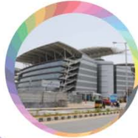
TCS - Siruseri